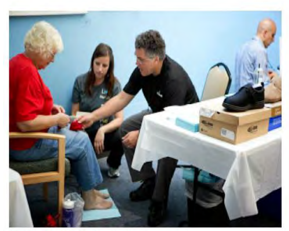
Kaiser Health Fair, Portland