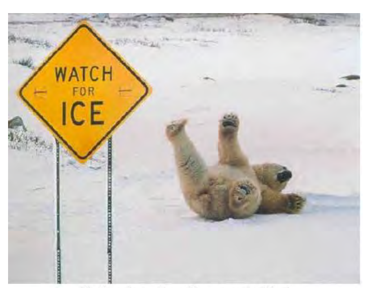
Injuries Are Preventable!

Alaska reported two key outcomes: 1) Hosting a successful fall risk screening prevention clinic, and 2) Providing two train-the-trainers events for falls prevention exercise programs.