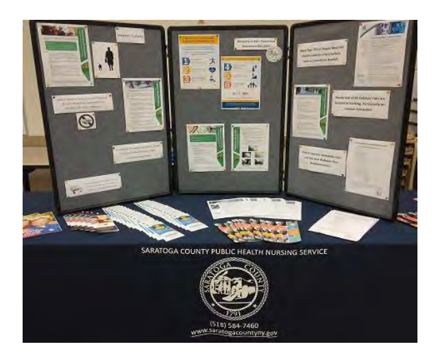
Saratoga County Public Health falls prevention information booth

New York City participated in a creative partnership with NCOA and <u>F.Y. Eye</u> to produce a falls prevention public service announcement that was carried through nonprofit video feeds in senior centers and other venues.