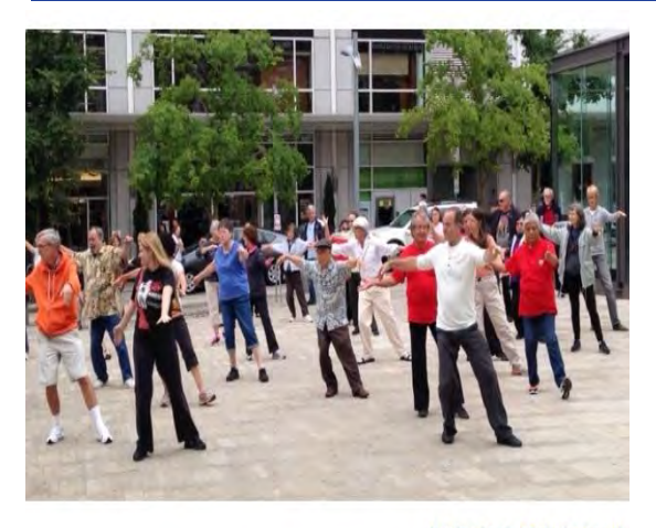
Tai Chi Flash Mob, Portland