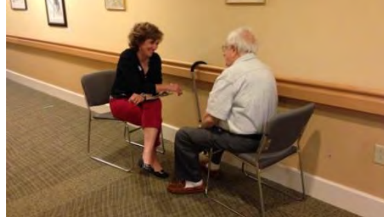
Left: Tai Chi demo with participants waiting to be screened. Right: screening event.

Key outcomes reported included: Expansion of partners and building upon collaborations; creating interest in membership of the Falls Free Coalition of Vermont; and working with the Governor's Commission on Successful Aging, Health Care Reform sub-committee to submit key findings and recommendations regarding the creation of a State Plan on Falls Prevention.