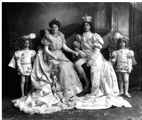
Mobile Mardi Gras Royalty, 1907

"CURRENTLY, 13,610 [E-BOOK] RECORDS HAVE BEEN ADDED TO SOUTHcat, MAKING THEM EASIER TO FIND THAN THROUGH THE NATIVE INTERFACES."